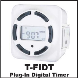
T-FIDT Plug-In Digital Timer