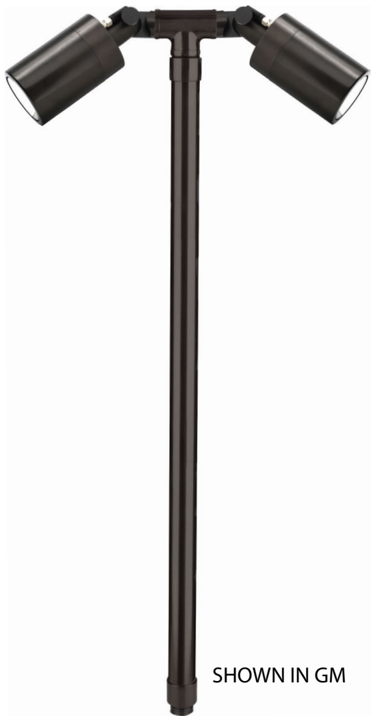
SHOWN IN GM