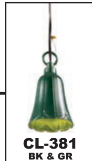
CL-381 BK & GR