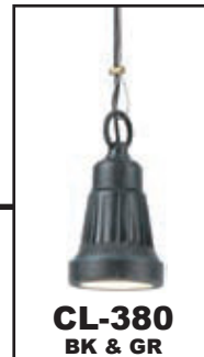
CL-380 BK & GR