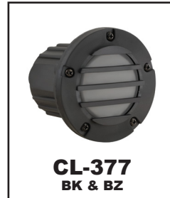
CL-377 BK & BZ