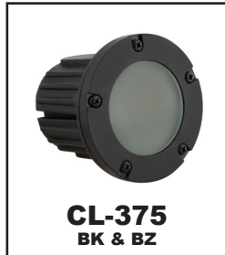
CL-375 BK & BZ