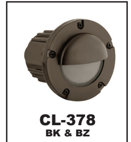
CL-378 BK & BZ