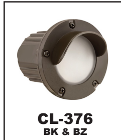
CL-376 BK & BZ