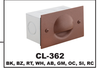
CL-362 BK, BZ, RT, WH, AB, GM, OC, SI, RC