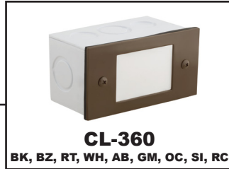
CL-360 BK, BZ, RT, WH, AB, GM, OC, SI, RC