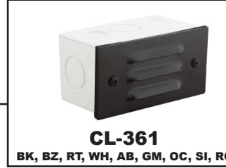
CL-361 BK, BZ, RT, WH, AB, GM, OC, SI, RC