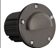
CL-349B AB & GM