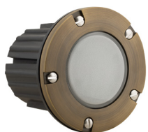
CL-346B AB & GM