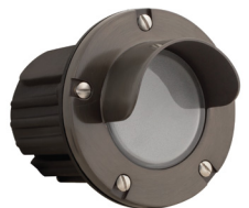
CL-347B AB & GM