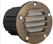
CL-348B AB & GM