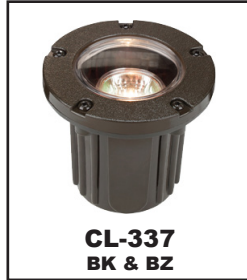
CL-337 BK & BZ