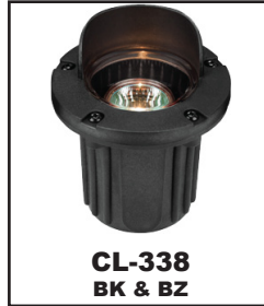
CL-338 BK & BZ