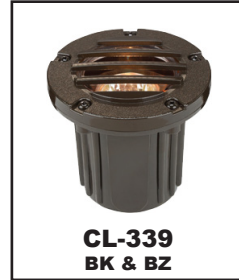
CL-339 BK & BZ