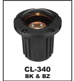
CL-340 BK & BZ