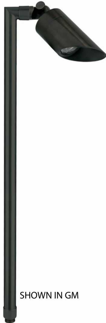
SHOWN IN GM