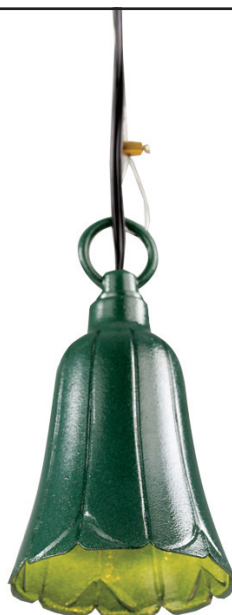
GR-Green finish shown

One (1) year warranty on fixture and housing against manufacturer's defects