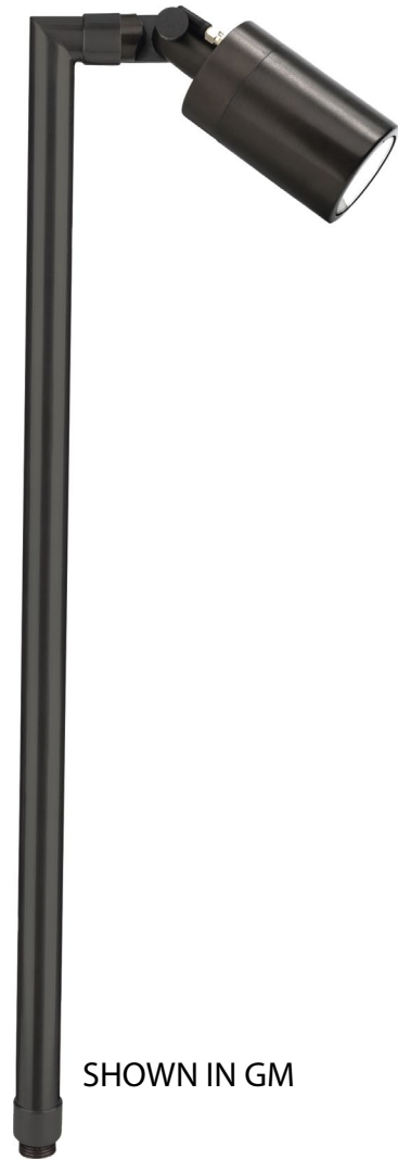
SHOWN IN GM