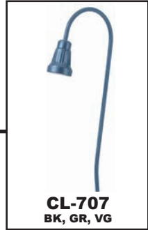
CL-707 BK, GR, VG