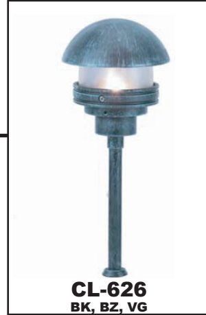
CL-626 BK, BZ, VG