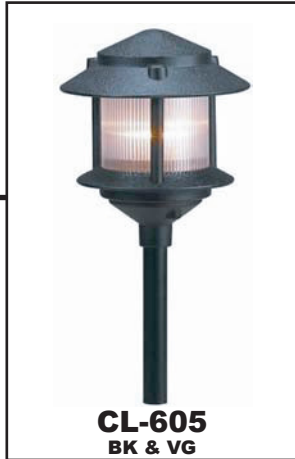
CL-605 BK & VG