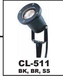
CL-511 BK, BR, SS