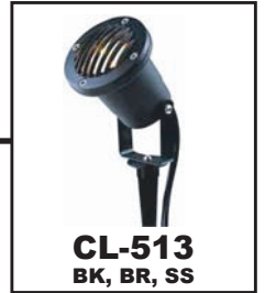
CL-513 BK, BR, SS