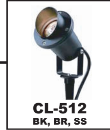
CL-512 BK, BR, SS