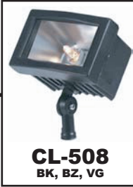
CL-508 BK, BZ, VG