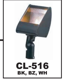
CL-516 BK, BZ, WH