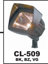
CL-509 BK, BZ, VG