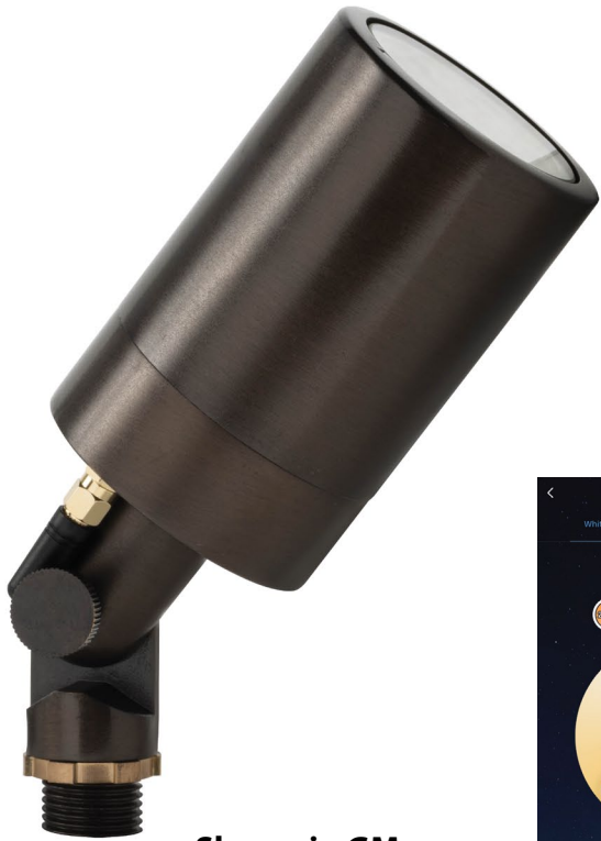
Shown in GM