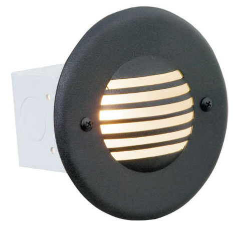
BK- Black finish shown