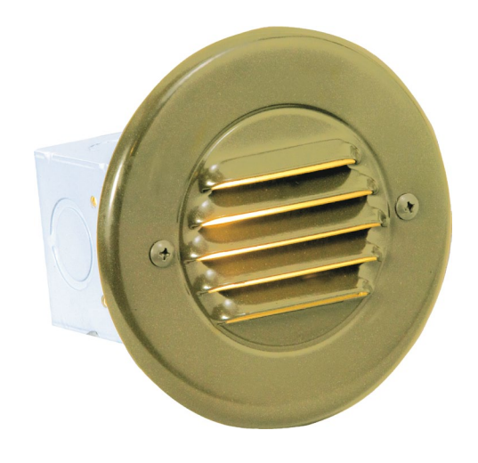
PB- Plated Brass shown