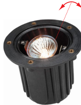
Fixture socket tilts for ± 25°